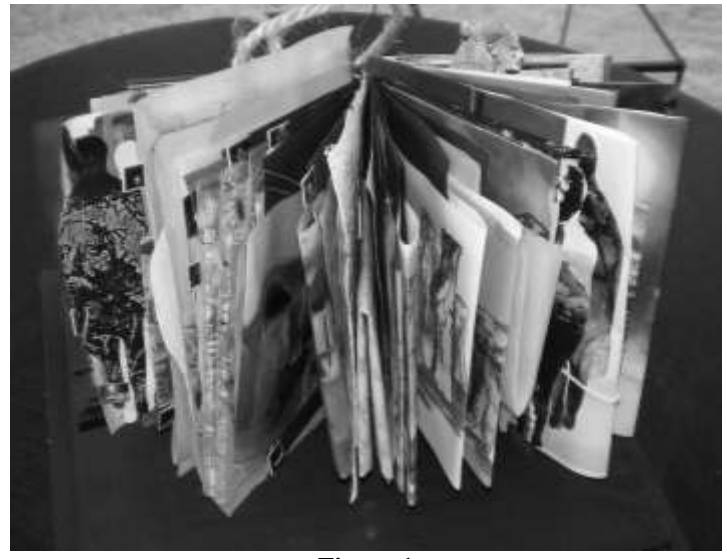
Figure 1 Cheryl Penn Night Crossing (2008, unique artists' book, multimedia, 19 x 33 x 23 cm, collection of the artist).

imagery and collage to tell a story about going to sleep and entering the world of dreams.