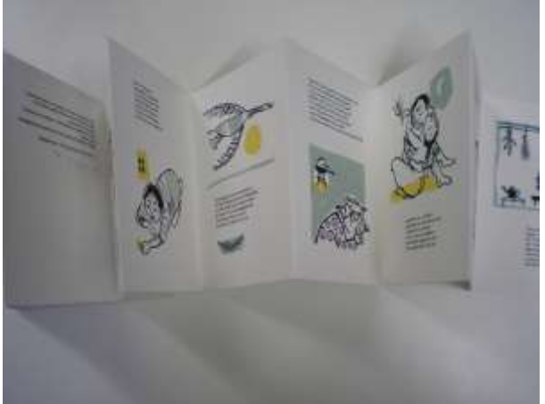
Figure 2 Piet Grobler 7 Boerneefgedigte (1997, screen printing, 15.5 x 20.5 x.7 cm, The Caversham Press).

An artist's book can also be produced as a printed edition which follows similar principles as in Piet Grobler's Boerneef poems (Figure 2); or it can be an 'altered' book in which one or more artists alter a pre-existing commercially printed book; and in the age of electronic media and libraries, it can even take the form of an electronic book. Artists' books can also be collaborations, in which more than one artist work together to create a book, e.g. Cheryl Penn and Estelle Liebenberg-Barkhuizen's 1984/1994 (Figure 3). Books can also be duplicated, hence becoming multiples of the same item.<sup>3</sup> It is important to note that the category 'artists' books', in its widest sense, includes a variety of books which range from artist's sketchbooks to books conceived and bound specifically by artists. According to arguments presented by most scholars and writers, artists' books are not only books containing works of art, such as sketch books: the book, with everything it encompases, is the original work of art.